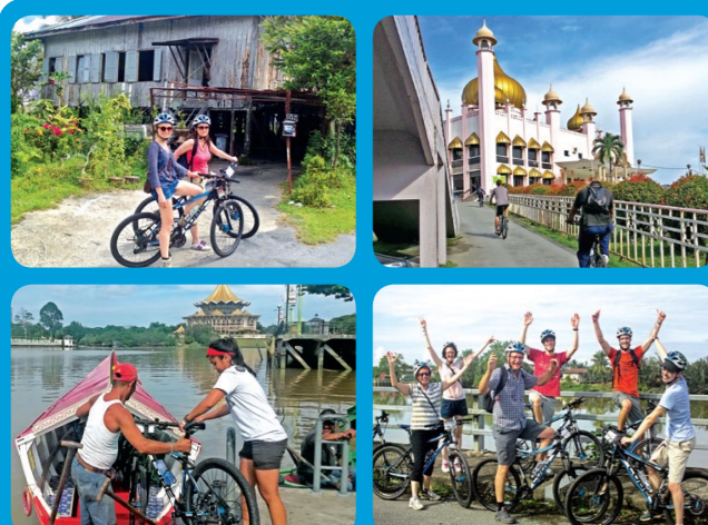
LOCAL BIKE DISCOVERY