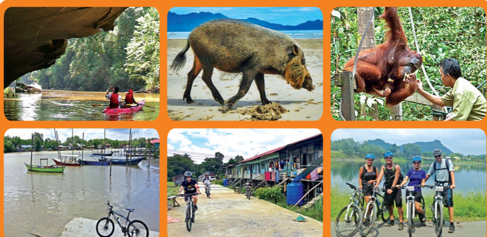
BORNEO SARAWAK BIKE HOLIDAY