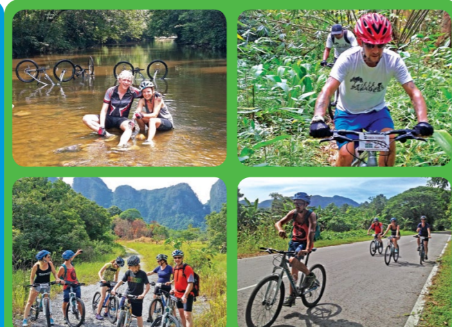
ADVENTURE BORNEO BIKING