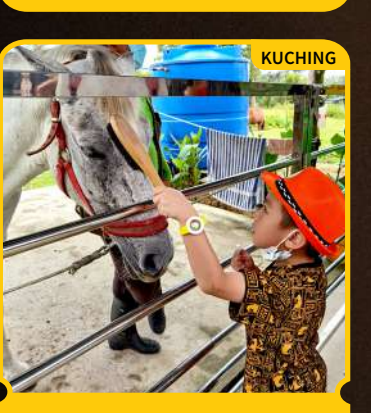
BORNEO HAPPY FARM