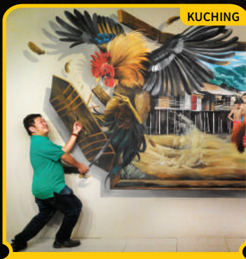
BORNEO HOUSE OF MUSEUM