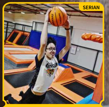
JUMP TRAMPOLINE & CHILDREN PLAYGROUND