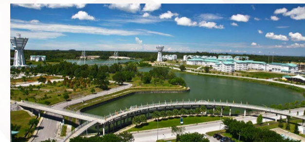
University Malaysia Sarawak (UNIMAS)

Kota Samarahan has booming commercial centres with malls such as The Summer Mall and Aiman Mall with plenty of restaurants and fast-food outlets catering to the increasing population.