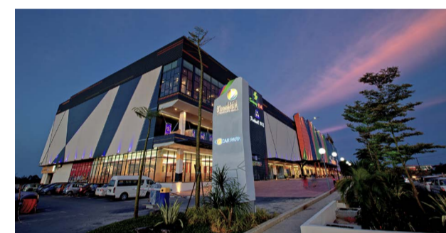
The Summer Mall