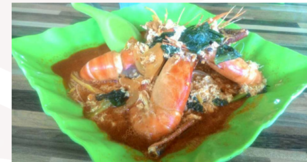
Mee Udang Gumpay