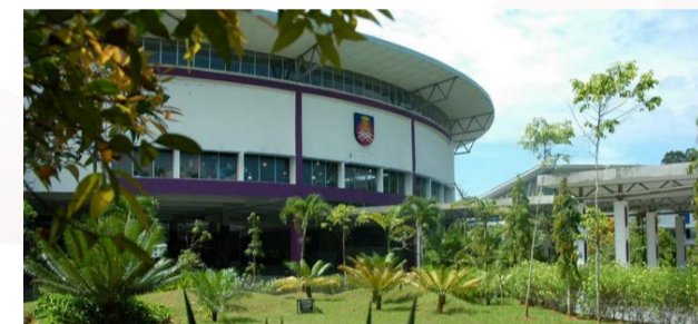
Mara University of Technology (UTM) Samarahan Campus