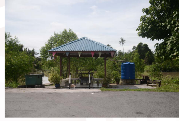
Kampung Entingan Jetty

Samarahan Division is known to have the most crocodiles in Sarawak. Visitors can observe crocodiles and crocodile feeding sessions in the village of Kampung Entingan situated along the Tuang River. To get there, look out for the roundabout that shows the exit to the UTM campus and follow the signs to Kampung Entingan.